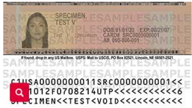
Permanent Resident Card with notation, "Signature Waived":